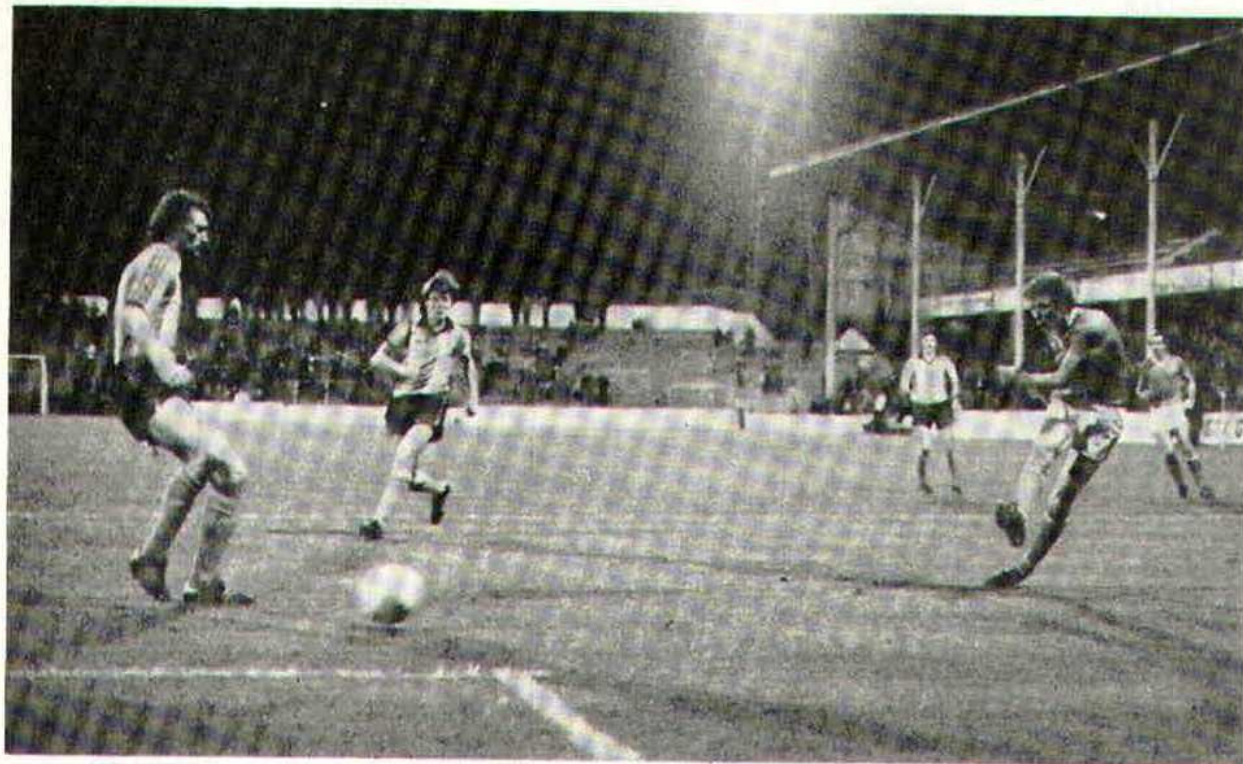
Two goal hero Chic Bates (right) tries another goalbound shot against Peterborough at the County Ground, where the Town won 3 - 1.